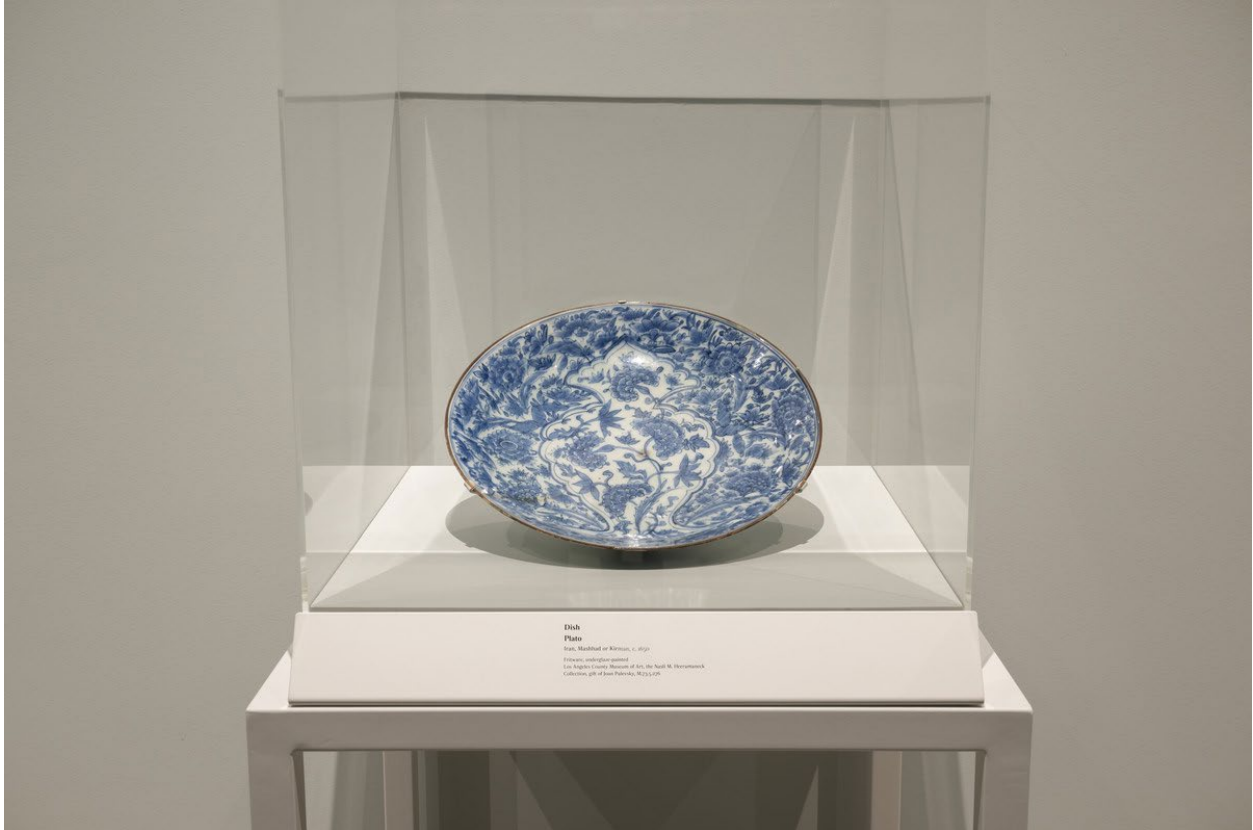
Installation photograph, Dining with the Sultan at Charles White Elementary School , Los Angeles County Museum of Art, Jan 20–Aug 10, 2024, photo © Museum Associates/LACMA

I may also see art on tables with glass around them. I will look at the art but I will not touch it. The text near the artwork tells me more about it.