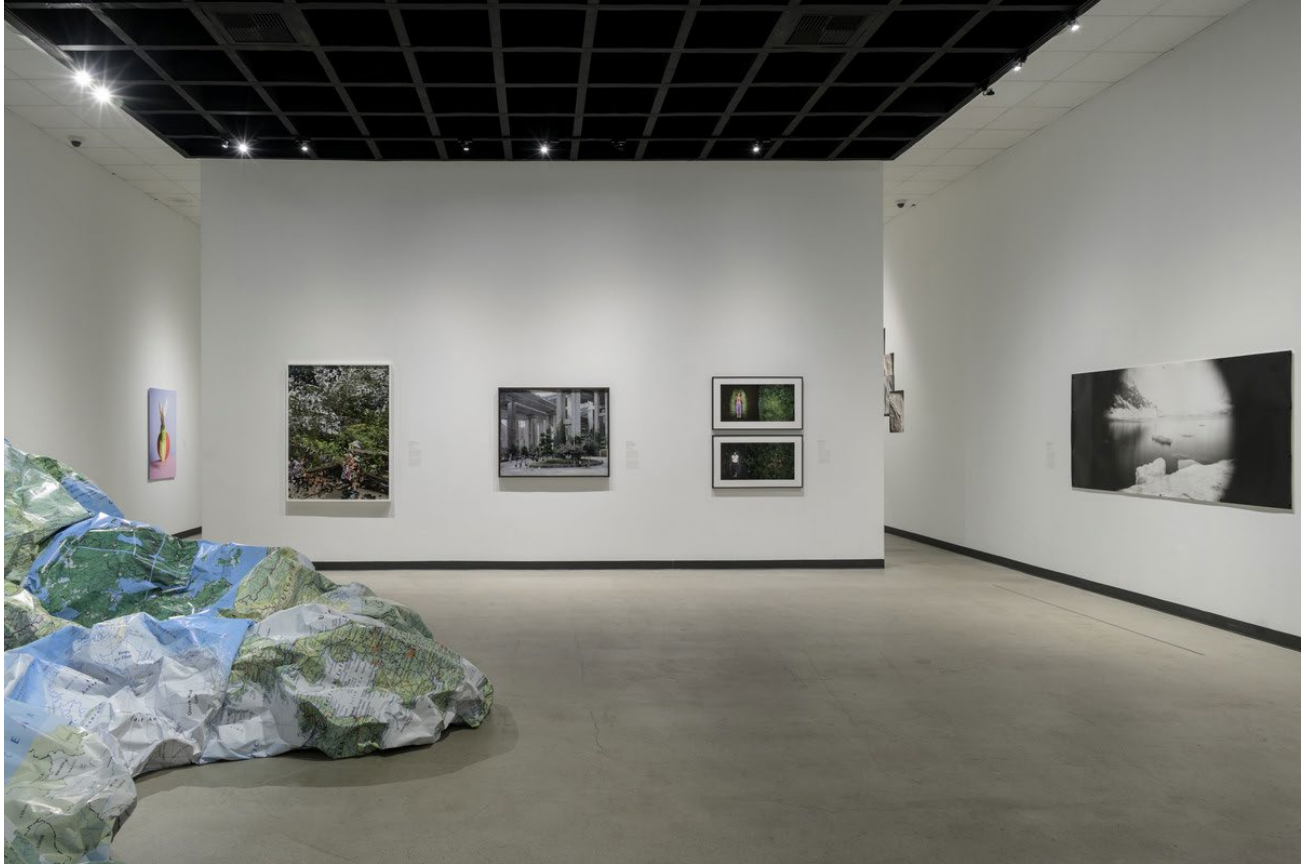
Installation photograph, Nature on Notice: Contemporary Art and Ecology , Charles White Elementary School Gallery, Dec 21, 2024–Aug 2, 2025

When I am ready, I may enter the gallery and look at the art! Every year there is a different exhibition and something new to see. The photo above is an example of what I might see. There may be art on the walls and on the floor. There are multiple ways to go through the gallery: I can go to the left or right. There are several rooms to visit.